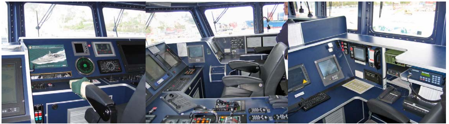
Inside the Bridge