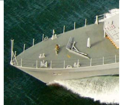
Ships Guns; 3 x .50 Caliber Machine Guns In action at sea, port side upper deck covered mounting, covered mounting centre of fore deck.